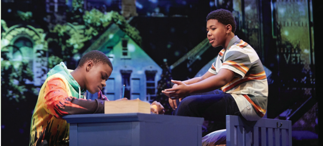
THE GEFFEN PLAYHOUSE PRODUCTION OF BLACK SUPER HERO MAGIC MAMA.

Theater at its core is storytelling. Storytelling is an important part of human culture and history. Sharing narratives can illuminate where we come from and our current experiences, entertain us, strengthen our sense of shared values, and even allow us to envision future possibilities.