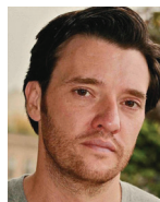
Jason Butler Harner as Don