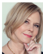
JoBeth Williams as Marcie